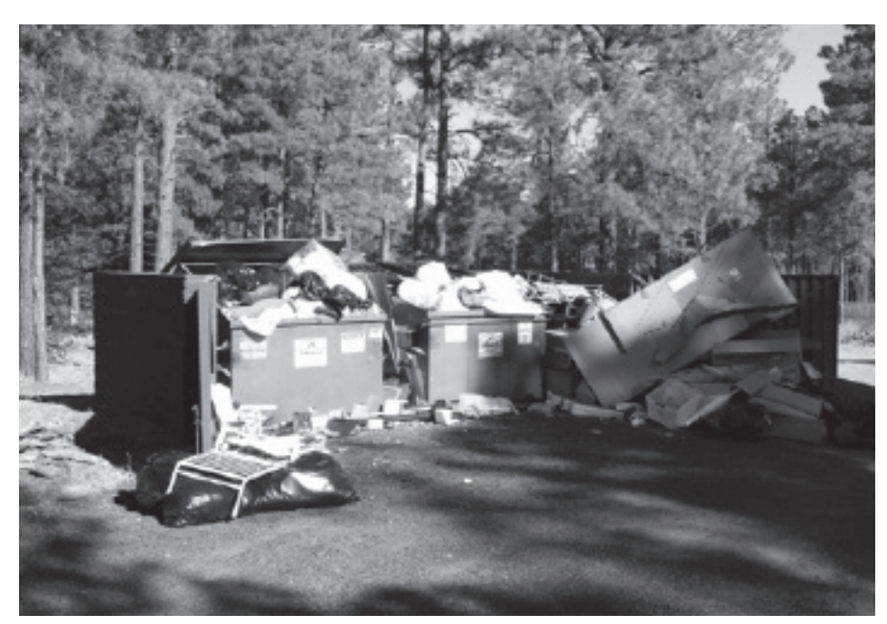
Illegal dumping at the Community Dumpster continues

The dumpster is located on Buckthorn near Highway 60 (located between the Golf Maintenance Yard and the Equestrian Center). The purpose of this dumpster is not for your landscaper to dump your landscape clippings or for you to dispose of an old appliance or moving boxes. This dumpster was approved by the Board for weekend residents who are not here for Monday trash pickup. The dumpster has a bear proof lid so if you need to dispose of your household trash and garbage prior to Monday trash pickup, the community dumpster is available and hopefully, will help keep the bears out of Torreon. In the past years, several bears have been killed by Game and Fish after returning to Torreon a second time to get into garbage cans during the night or early morning hours. Please utilize the community dumpster for the purpose that it was intended for. The Board of Directors and your neighbors thank you in advance for your cooperation.